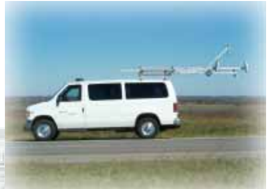
Fugro-BRE ADVantage® pavement rig

Introducing the Fugro ADVantage ®, Automated Distress Vehicle, the pavement industry's first completely automated digital pavement distress surveying system. The ADVantage gathers high-resolution digital images of the pavement using a system of synchronized strobe lights and a digital camera. It is capable of covering 100% of the pavement surface at highway speeds on lanes up to 14 feet in width. The ADVantage's onboard systems are programmed to automatically adjust the data acquisition rate to allow for changes in vehicle speed, due to traffic conditions or traffic control devices. It has already been tailored to produce distress indices based on AASHTO, Universal Cracking Indicator and Texas DOT protocols. The ADVantage can also be programmed to meet the needs of any individual agency. All data acquisition and processing is conducted in real-time (as the images are being collected.)